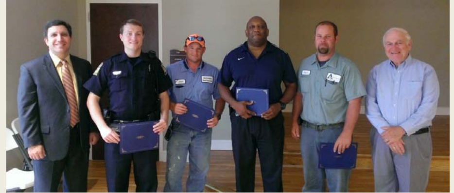
Crew Leader Graduation