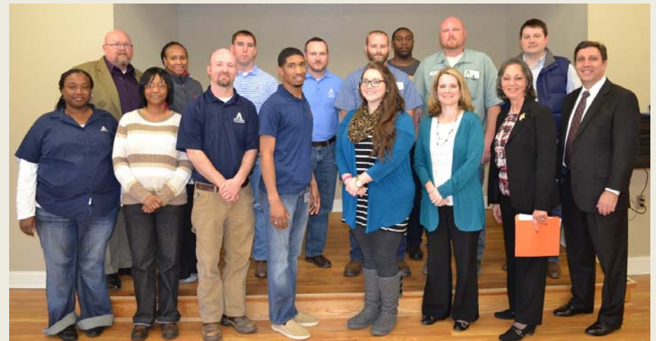
Customer Service Certification